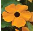
Orange with Eye