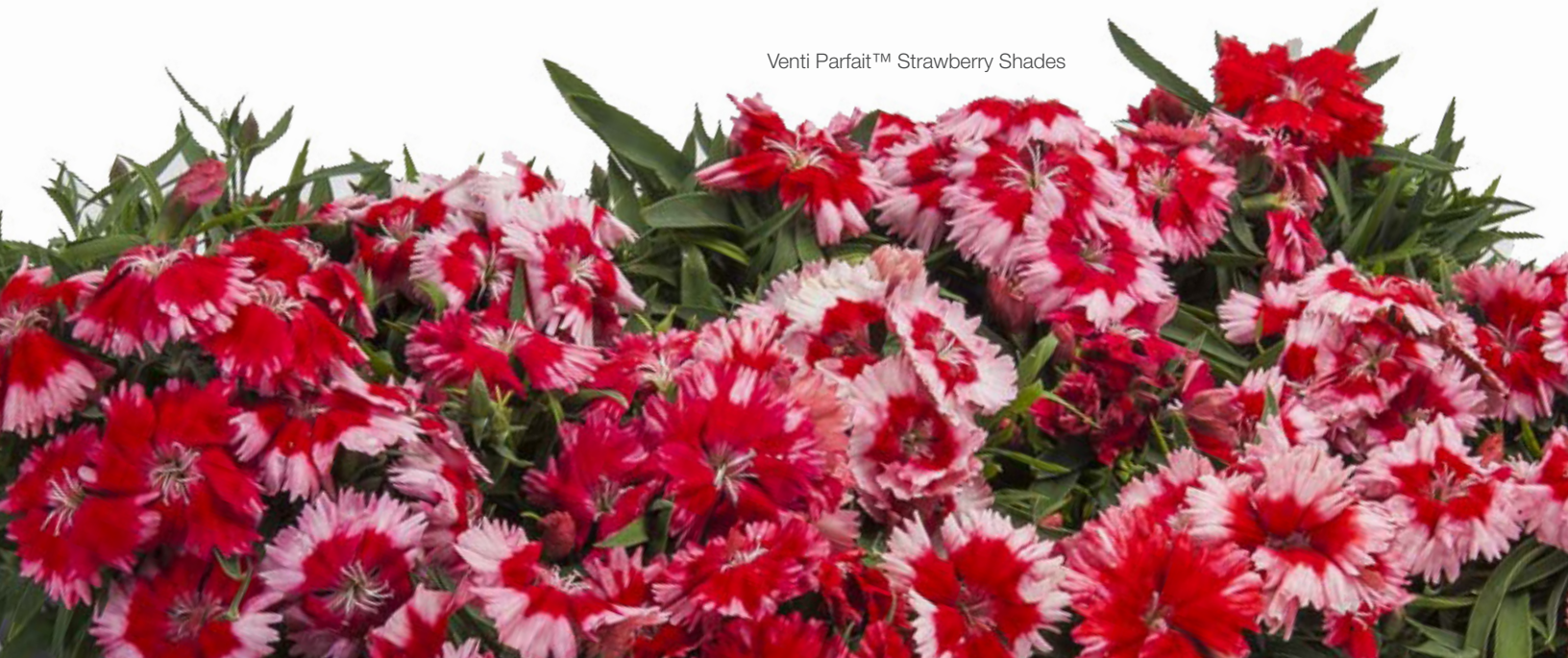
Venti Parfait™ Strawberry Shades