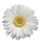
White with Light Eye