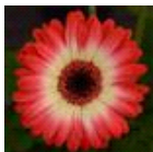
Bicolor Red Lemon