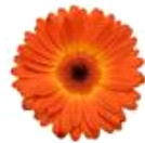
Bicolor Yellow Orange