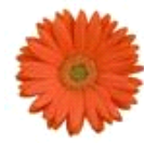
Orange with Light Eye