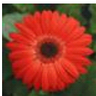
Red with Dark Eye