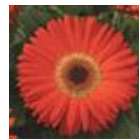
Deep Orange with Dark Eye