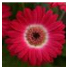
Bicolor Rose White