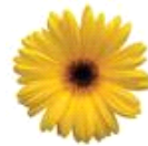
Golden Yellow with Dark Eye